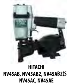
HITACHI NV45AB, NV45AB2, NV45AB2(S), NV45AC, NV45AE