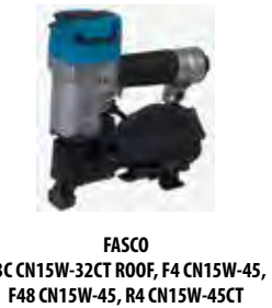
FASCO F3C CN15W-32CT ROOF, F4 CN15W-45, F48 CN15W-45, R4 CN15W-45CT