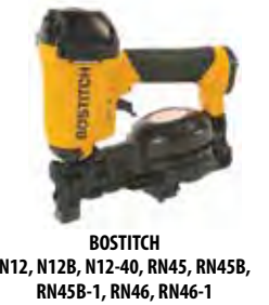
BOSTITCH N12, N12B, N12-40, RN45, RN45B, RN45B-1, RN46, RN46-1