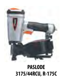
PASLODE 3175/44RCU, R-175C