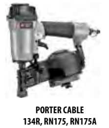
PORTER CABLE 134R, RN175, RN175A