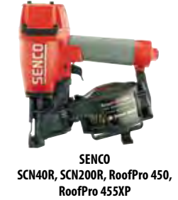
SENCO SCN40R, SCN200R, RoofPro 450, RoofPro 455XP