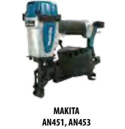
MAKITA AN451, AN453