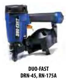
DUO-FAST DRN-45, RN-175A