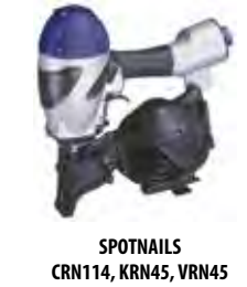
SPOTNAILS CRN114, KRN45, VRN45