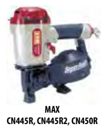
MAX CN445R, CN445R2, CN450R