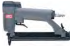
SENCO SJ10 A06-D10