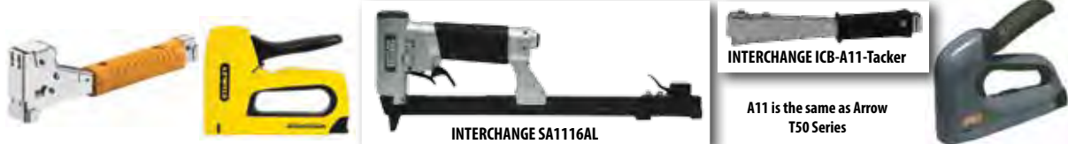
ARROW HT-50, HT-55, T-50, ETFX50, ETG50BN, ETF50PBN, T50PBN, RAPID 54