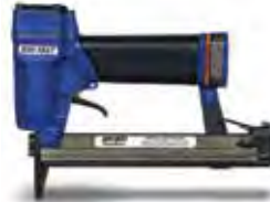
DUO-FAST BN-5424, SureShot 5424