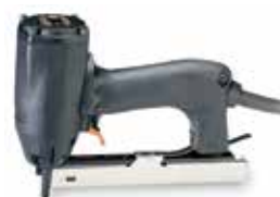
DUO-FAST A-5418, ENC-5418 electric, ENC-5418A