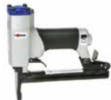
SPOTNAILS DS5016, JS5016, JS5016LN, BS5016AF