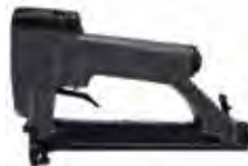
SENCO SJS-F, SJ10-F, J5