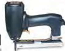
DUO-FAST E5-018, EWC-5018A