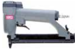
SENCO SJ10 G06-G10