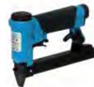
FASCO F1A SR5-16, F1B SR5-16