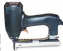
DUO-FAST E5-018, EWC-5018A