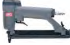
SENCO SJ10 A04-A08, SJ10 A06-D10