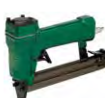
OMER 50.16 CL, 50.16 CLV, 50.16 OC, 50.16 RB, 50.16 S, 50.16 SCL