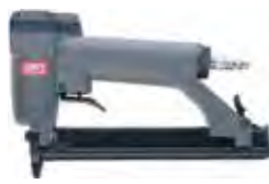
SENCO SJ10 G06-G10