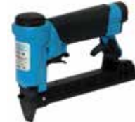
FASCO F1A SR5-16, F1B SR5-16