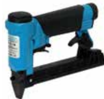
FASCO F1B 50-16, F1A 50-60, T-HT550, T-R19