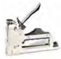
DUO-FAST CT-859, CS-5000