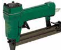
OMER 50.16 CL, 50.16 CLV, 50.16 OC, 50.16 RB, 50.16 S, 50.16 SCL