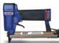
DUO-FAST A-5020, HT550, HT550C, SureShot 5020