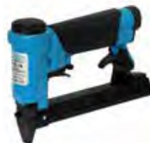
FASCO F1B 50-16, F1A 50-60, T-HT550, T-R19