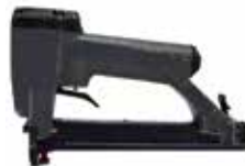
SENCO SJS-F, SJ10-F, JS