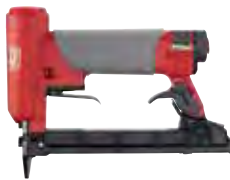
SENCO SFW10XP-F, SFT10XP