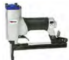
SPOTNAILS DS5016, JS5016, JS5016LN, BS5016AF