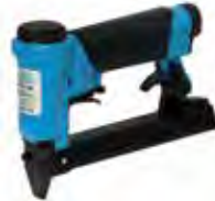
FASCO F1A 54DF-18, F1B 54DF-18

20 Ga. Narrow Crown Fine Wire Staples (available in both Chisel and Divergent Point)