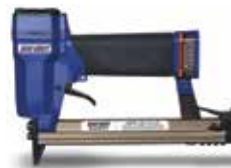
DUO-FAST A-5020, HT550, HT550C, SureShot 5020