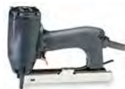
DUO-FAST A-5418, ENC-5418 electric, ENC-5418A