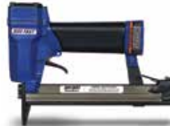
DUO-FAST BN-5424, SureShot 5424