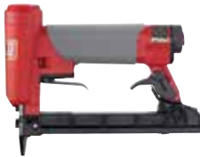
SENCO SFW10XP-F, SFT10XP