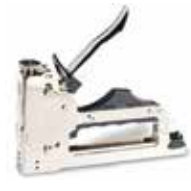
DUO-FAST CT-859, CS-5000