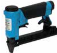
FASCO F1A 54DF-18, F1B 54DF-18

20 Ga. Narrow Crown Fine Wire Staples (available in both Chisel and Divergent Point)